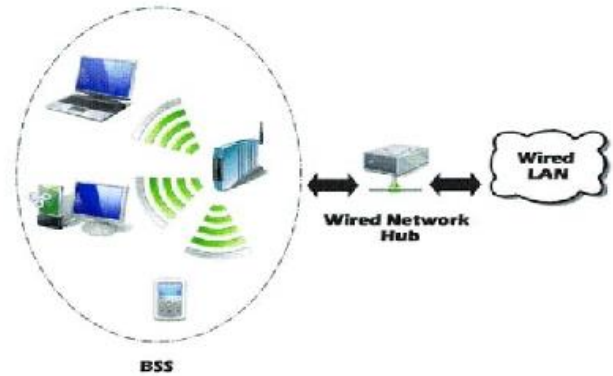
Figure 1: Wireless LANs (BSS structure).

Clients or end-user devices and Access Points. The basic structure of a Wireless LAN is called infrastructure WLAN or BSS (Basic Service Set) shown in figure 1, in which the network consists of an access point and several wireless devices. When these devices try to communicate among themselves they propagate their data through the access point device.