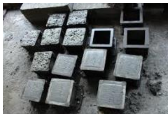
Fig -7 concrete cube

Demoulding: The casted specimens are demoulded in such a way that there is no possibility of damaging of specimens.