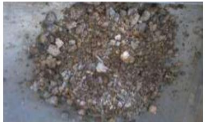
Figure 1: Hypo-sludge

amount of silica and magnesium properties that it behaves like cement. use of hypo sludge in concrete can save the paper industry disposal cost and also produced a sustainable concrete for construction.