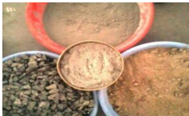
Fig 6-Material used

a coarse aggregate. The mixture is turned over twice in a dry state.