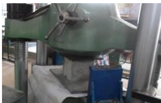
Fig-8 universal testing machine

Tests on Hardened Concrete: Compressive Strength Test: Compressive strength is the capacity of a material or structure to withstand axially directed pushing forces. When the limit of compressive strength is reached, brittle materials are crushed. Testing Machine: The testing machine may be of any reliable type, of sufficient capacity for the tests and capable of applying the load at the required rate. The permissible error shall be not greater than \pm 2 percent of the maximum load. The testing machine shall be equipped with two steel bearing platens with hardened faces. One of the platens (preferably the one that normally will bear on the upper surface portion of a sphere, the centre of which coincides with the central point of the face of the platen. The other compression platen shall be plain rigid bearing block. The bearing faces of both platens shall be at least as large as, and preferably larger than the nominal size of the specimen to which the load is applied. The compression mechanism is shown in Figure Compressive Strength = P/A Where, P - Ultimate Load A - Cross sectional area of the specimen.