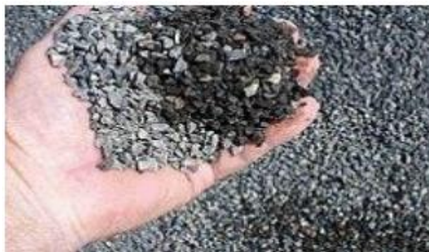
Fig 4-fine aggregate

Reckon 3s fiber was utilized as an optional fortification material. It captures shrinkage splits and expands imperviousness to water infiltration, scraped spot and effect. It makes concrete homogenous furthermore enhances the compressive quality, pliability and flexural quality together.