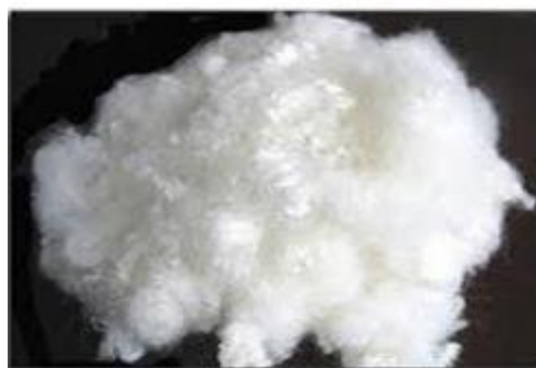
Fig 5: Reckon 3's fiber