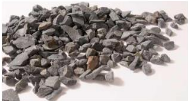
Fig 4: Coarse aggregate

The divisions from 20 mm to 4.75 mm are utilized as coarse total. The Coarse Aggregates from smashed Basalt rock. The Flakiness and Elongation Index were kept up well underneath 15%