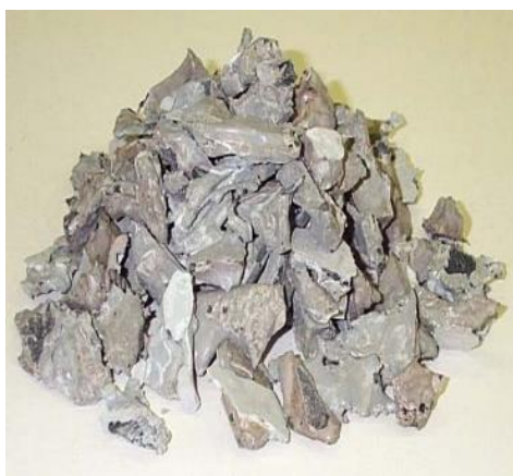
Figure 2: 20 mm rubber aggregate coated with cement paste

All mixtures were mixed manually. Mixing procedures were the same for all concrete mixes. As for the rubberized concrete mixtures, the fine aggregate, rubber tyre chips and cement were added gradually to the mix and mixed thoroughly. Water was then added gradually to the mix for a period of 2 minutes and followed by mixing for 5 minutes to produce a uniform mix.