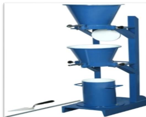
Figure 4: Compaction factor test

3. Compressive Strength: After 7 days and 28 days of curing the cubes were taken out of the curing tank and tested for their Compressive Strength in a Compression Testing Machine. The load was applied at a rate of 14 N/mm 2 per minute as per the code IS-6:1959 (Figure 5).