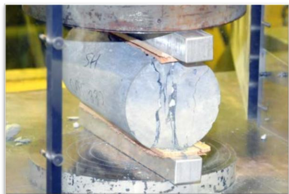
Figure 7: Split tensile test