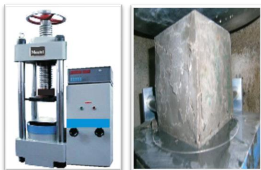
Figure 5: Compressive strength test

4 Flexural Strength: In this test, a load is applied through two rollers at the third points of the span until the specimen breaks. After 7 days and 28 days of curing the beams were taken out from the curing tank and tested for their Flexural Strength by two point loading method (IS – 516:1959).