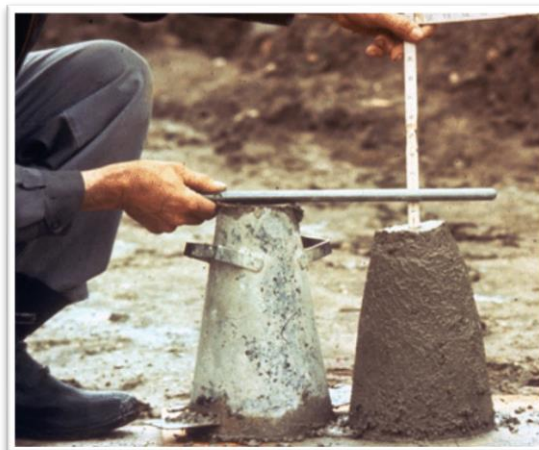
Figure 3: Slump test

1. Slump Tests: The mould for the slump test is in the form of a frustum of a cone, which is placed inside a hollow cylinder on the top of a plate. The value of the slump is obtained from the distance between the underside of the round tamping bar and the highest point on the surface of the slumped concrete sample (Figure 3).