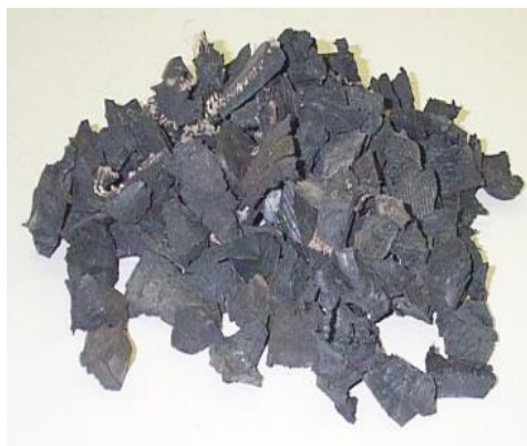
Figure 1: 20 mm plain rubber aggregate