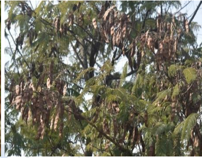
Collector: Name: Naveen Gautam