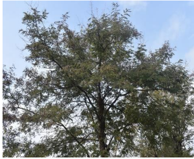
Collection Site: Badhani