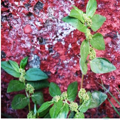
Collection Site: Ser