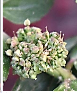
Collector Name: Naveen Gautam