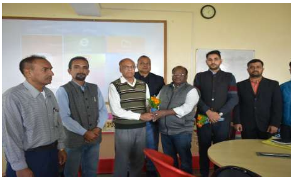
Awareness Camp Organized by L. N. Malviya Infra Executive Officers at Career Point University Hamirpur

Four Students of Bharat Scouts and Guides Selected for State Level Republic Day Parade 2023 07