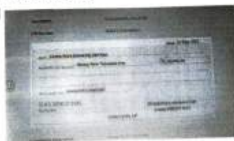
Career Point payment_Sept 2023.jpeg 104K