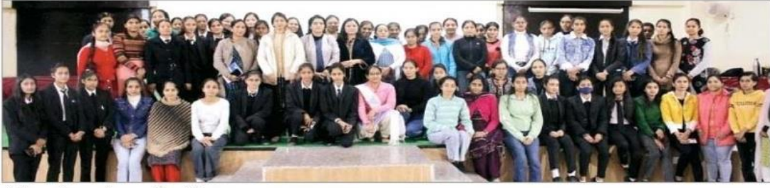
सैमीनार के उपरांत सामूहिक चित्र।